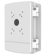
PFA140 Water-proof PowerBox