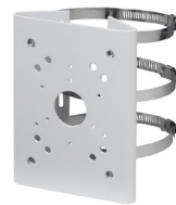
PFA150 Pole Mount